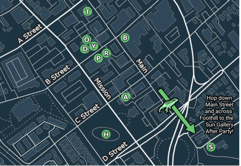
To Sun Gallery: Walk down Main Street, cross Foothill. Drive down Mission St, Left on D St, Right on 1st St.